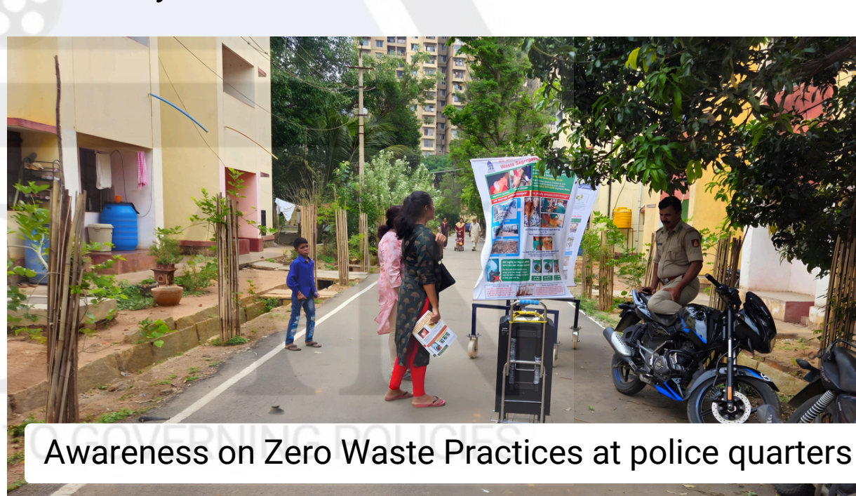
Awareness on Zero Waste Practices at police quarters