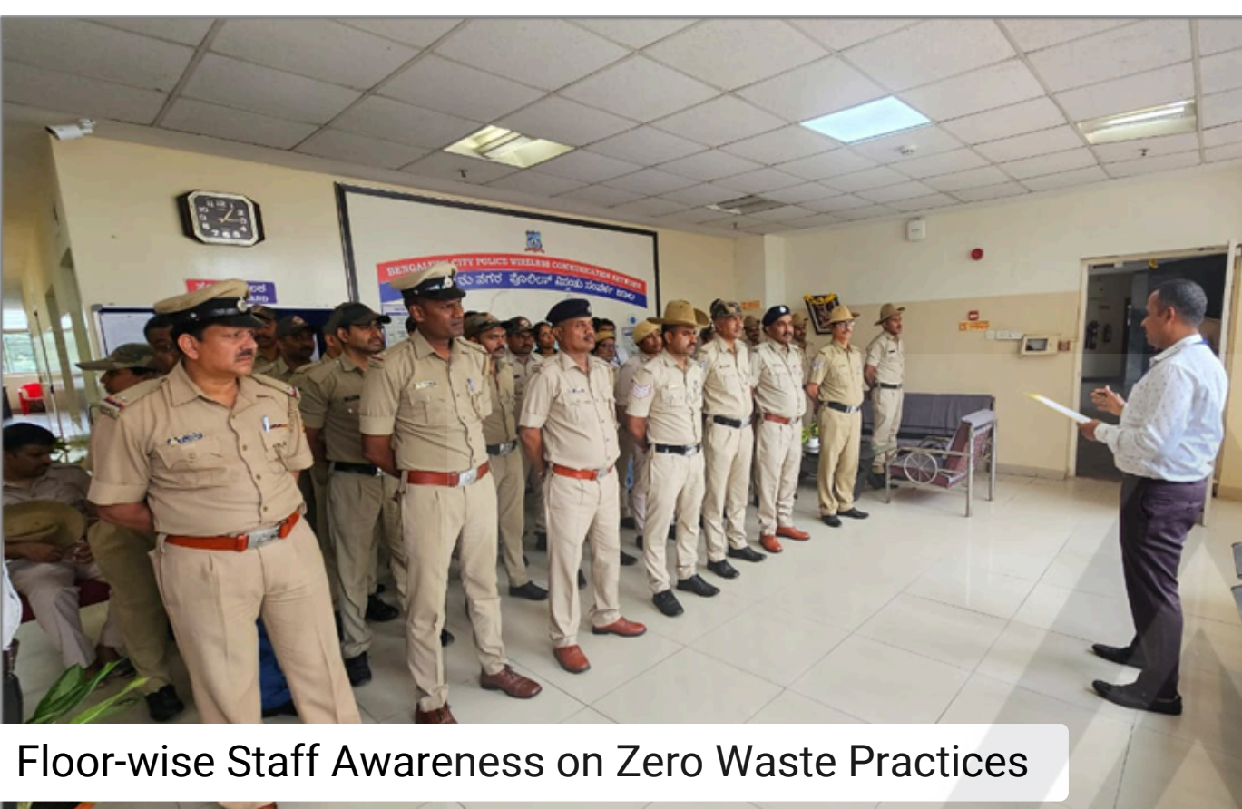
Floor-wise Staff Awareness on Zero Waste Practices

We conducted training and awareness sessions for the police staff on proper waste segregation and disposal and provided the housekeeping team with specialized training on collection and storage methods. This enabled maximum recovery and sale of recyclables—with the proceeds being donated to the Police Benevolent Fund.