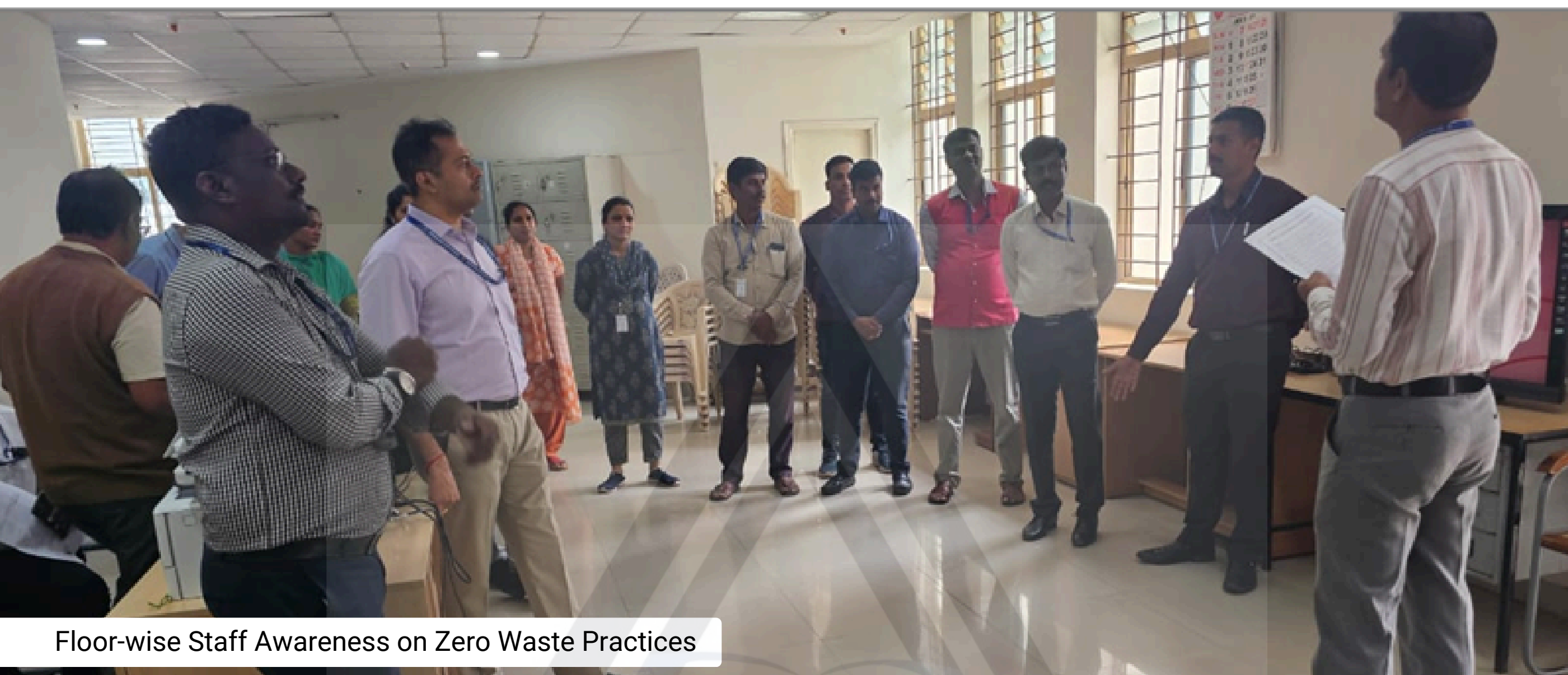
Floor-wise Staff Awareness on Zero Waste Practices