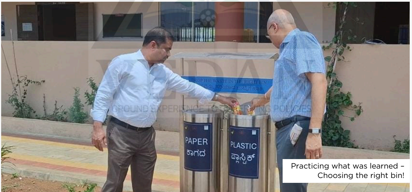
Practicing what was learned – Choosing the right bin!

But infrastructure alone does not change behaviour. So around 100 awareness boards and instructional displays were installed across the campus.