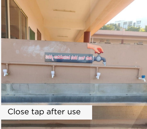
Close tap after use