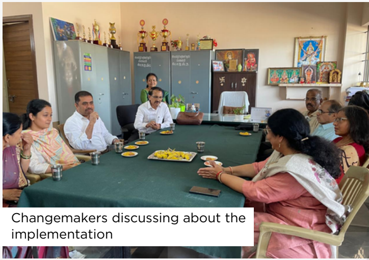
Changemakers discussing about the implementation