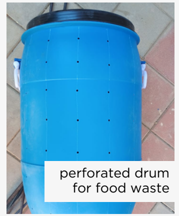
perforated drum for food waste

Litter bins were placed across the campus grounds. Blue bins were installed in classrooms and key areas to enable segregation at source.