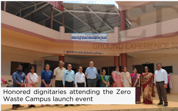
Honored dignitaries attending the Zero Waste Campus launch event

On 27 March 2025 , the Zero Waste Campus was formally inaugurated in the presence of representatives from SVP India, FANUC and Vedan. The event included an orientation session, inauguration of the Dry Waste Aggregation Centre, and a campus walkthrough. Yet the real success lies in what happened afterward