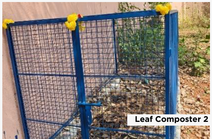
Leaf Composter 2