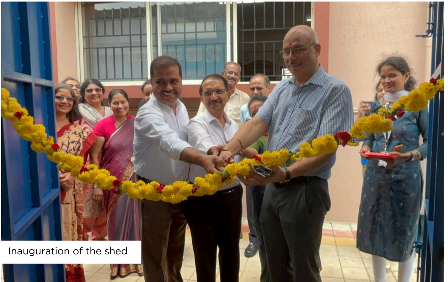
Inauguration of the shed

In September 2024 , when Vedan conducted a Zero Waste Audit at Government High School, Konappana Agrahara in Electronics City, Bengaluru, the gaps were evident. There were no bins in classrooms or playgrounds. Waste was mixed and stored together. Leaves accumulated across the campus. The existing composting system was poorly designed. In some areas, waste was even being burnt.