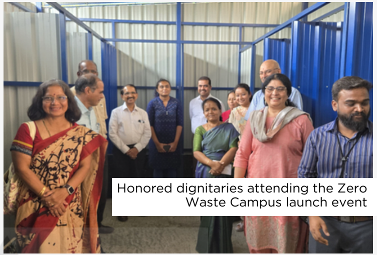
Honored dignitaries attending the Zero Waste Campus launch event