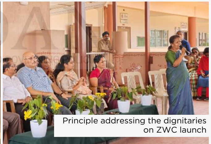
Principle addressing the dignitaries on ZWC launch

Dry waste is now collected and stored in the aggregation shed instead of being mixed or burnt. Sub-staff have begun systematic segregation. The school is preparing to measure the quantity of waste generated and track revenue earned from recyclable materials. What started as an audit has become a functioning model. The success at GHS Konappana Agrahara has already created momentum – leading to plans to convert five additional government schools into Zero Waste Campuses. This journey shows that transformation does not require scale – it requires structure. With the right process, even a government school can become a model of sustainable waste management.