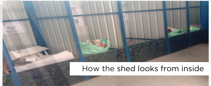
How the shed looks from inside