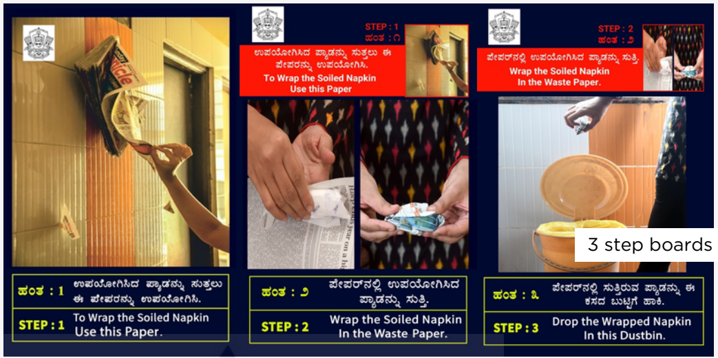
3 step boards