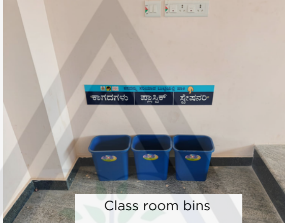
Class room bins