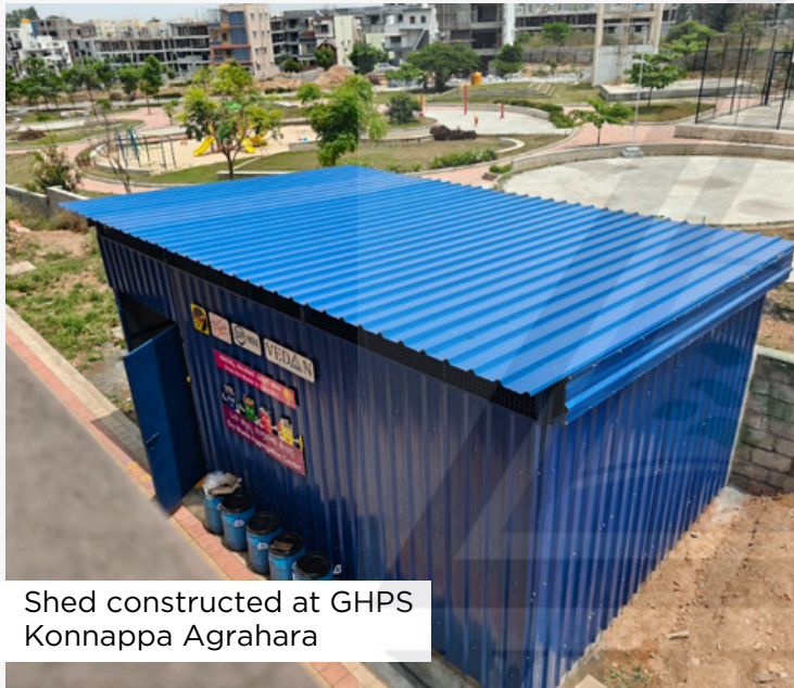
Shed constructed at GHPS Konnappa Agrahara