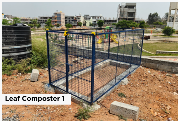
Leaf Composter 1

Two leaf composting units were set up – one at the back of the school and another near the parking area – ensuring that dry leaves and garden waste would now return to the soil as compost instead of being discarded.