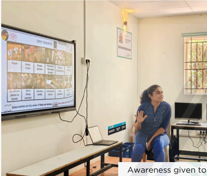
Awareness given to delegates on ZWC