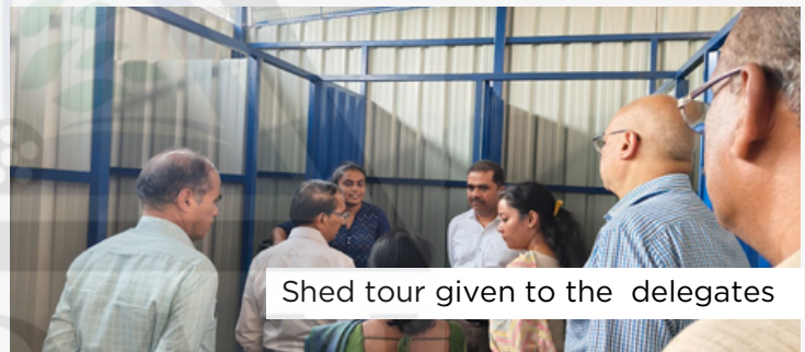
Shed tour given to the delegates

The first major step was the construction of a Dry Waste Aggregation Centre – a dedicated shed where paper, plastic, cardboard, and other recyclables could be sorted and stored systematically. Visual cut-outs of waste bins were installed on the shed, turning it into both an infrastructure unit and a behavioural reminder.